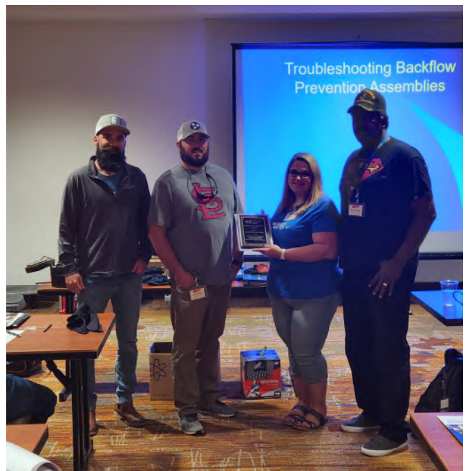
Clarkville Gas & Water received the water purveyor award