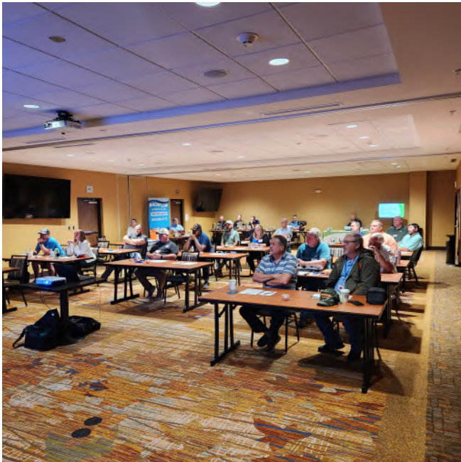
TBPA members attending 2023 conference