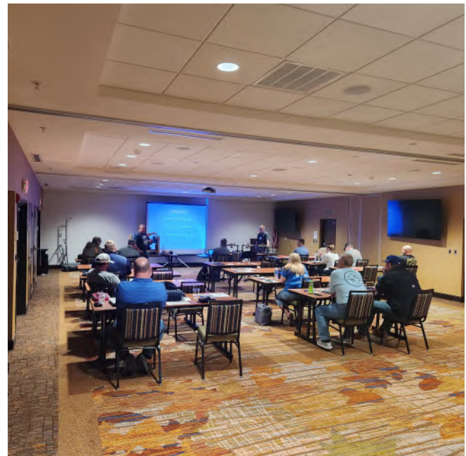
Wayne Osbourne talking about Shelbyville Water cross connection program