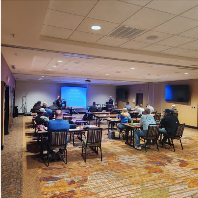
Watts representatives teaching repair class