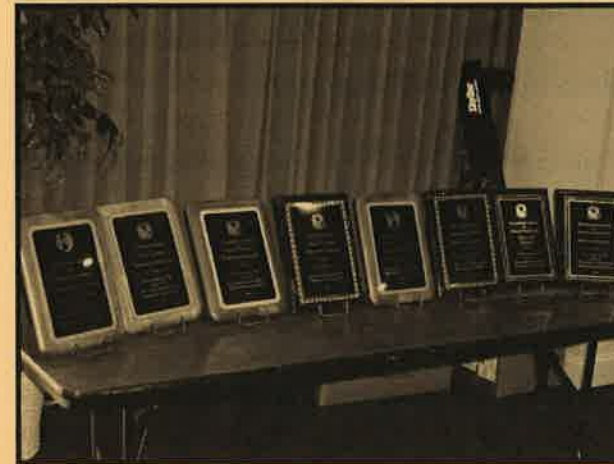
PACE Awards won by TBPA – Way to go Tennessee