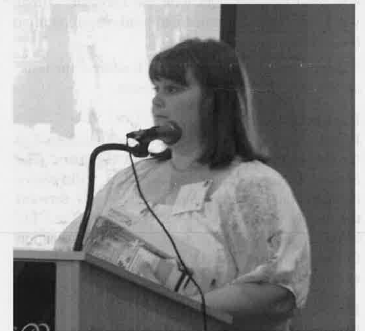
Angel welcomes everyone.

Visit the web site for Rules and Content information - www.abpa.org .