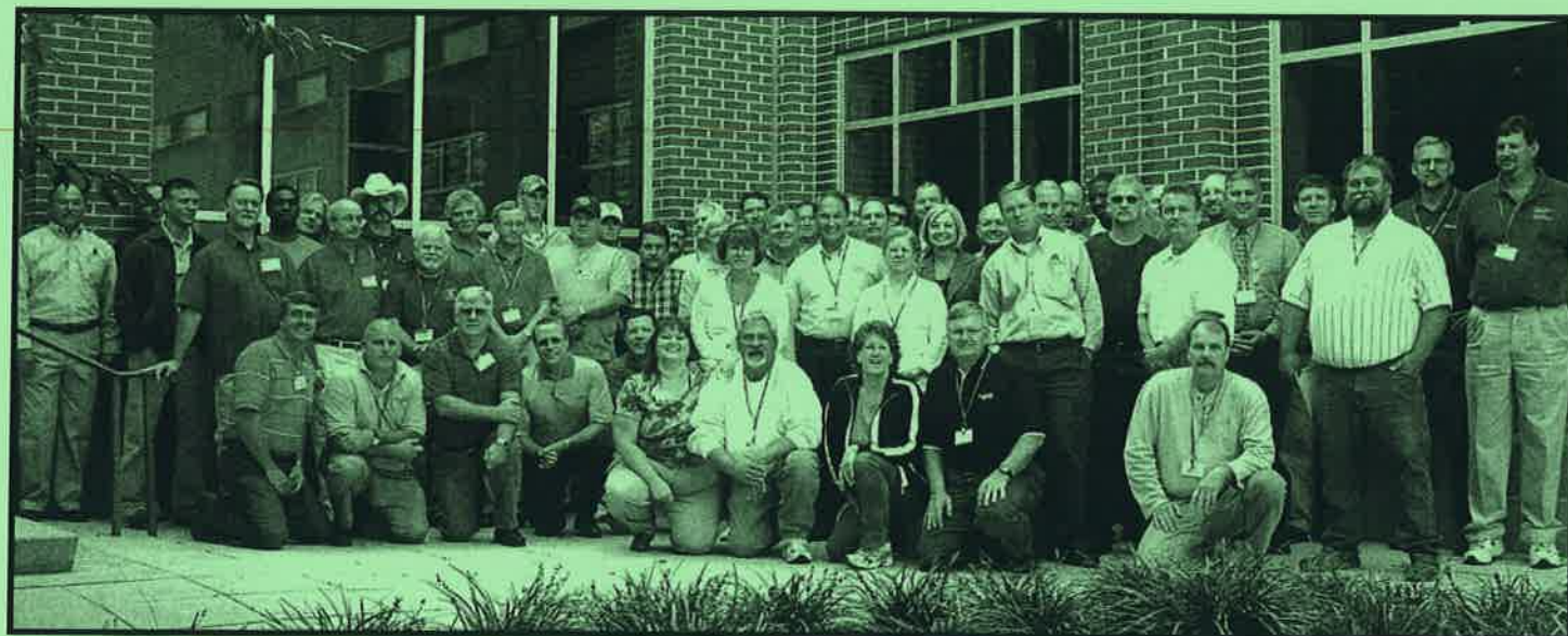
2008 Conference Attendees