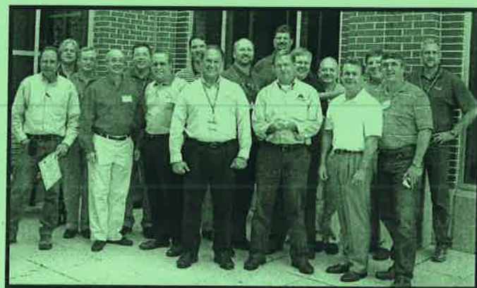
2008 Conference Vendors