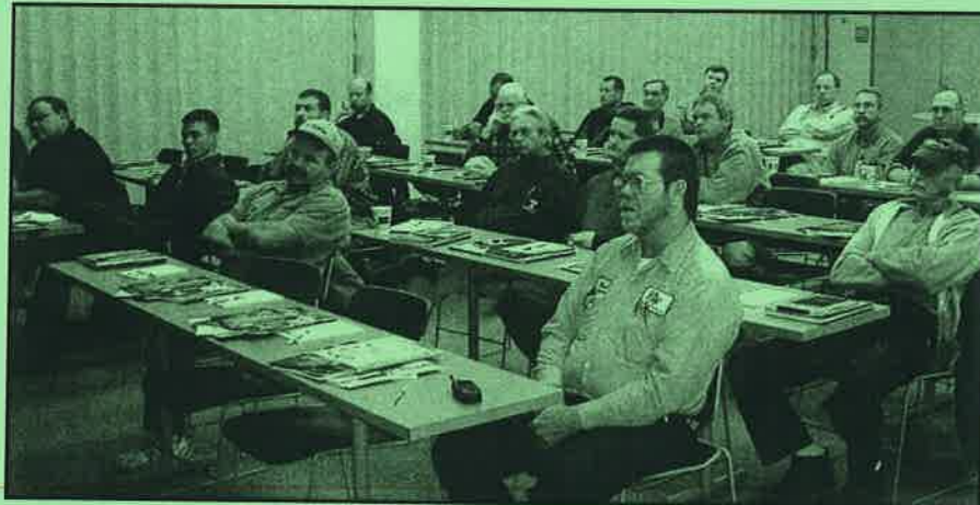
Attendees of the Wilkins Repair Class.

The Complete Source for all Backflow Parts & Accessories